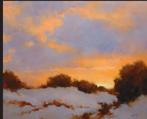
Be Still and Know Oil 16 x 20