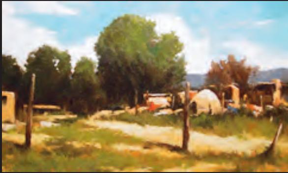
Taos Afternoon Oil 12 x 20