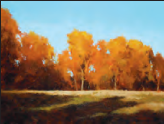
Autumn Treeline Oil 9 x 12