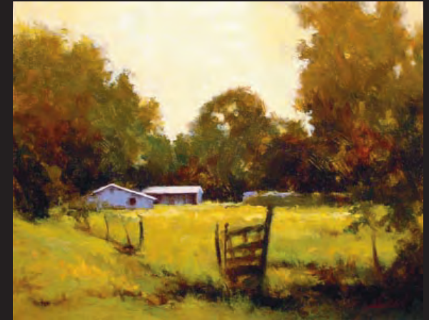
Summer Clearing Oil 11 x 14