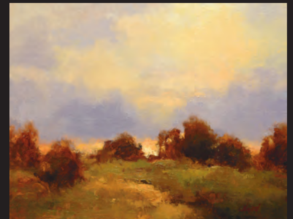
Approaching Evening Oil 11 x 14

Don continues the pursuit of hard work, commitment, and the magic that comes from capturing a fleeting moment in nature.